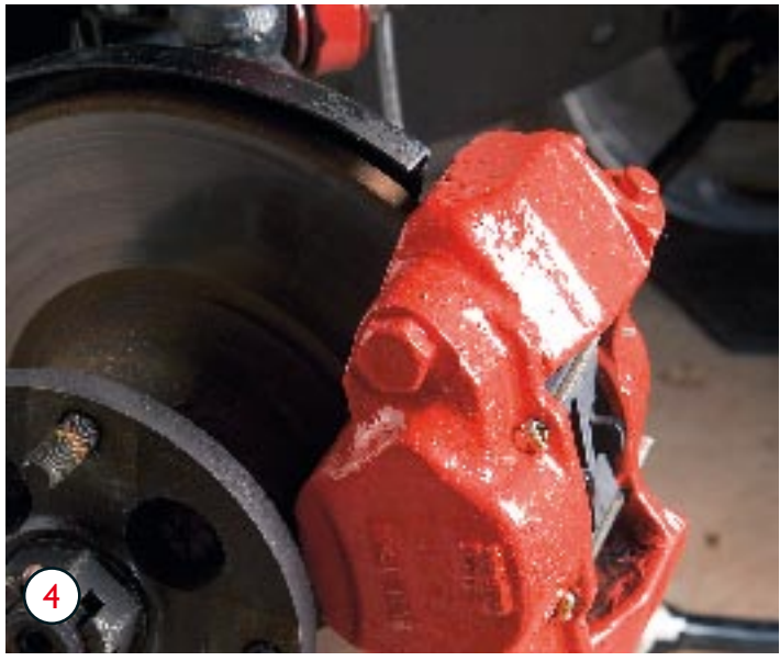
mptoms: Car pulling to one side when braking Diagnosis: Brake dust build-up

The front brakes rely on the four pads making contact with the brake disc at roughly the same time. If the car veers to one side when you brake the likely cause is a pad not reaching the disc at the same time as the rest, which could be due to a build up of brake dust on the pistons of the calliper or where the pads go. This may be cured by simply removing the pads, cleaning the calliper and refitting the pads again, but if the calliper pistons are damaged then the complete calliper will have to be replaced.