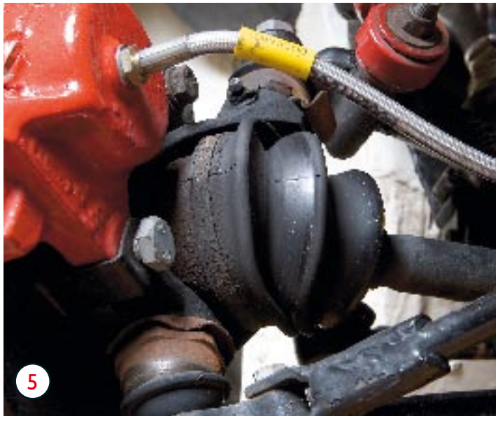
Symptoms: Knocking noise from the front with the steering on lock Diagnosis: Worn CV joint bearings

Jack the car up, remove the wheel and the split pins that hold the brake pads in, then take out the brake pads. Note which pad goes on which side of the calliper, as it will already be bedded into the brake disc. Also check the amount of friction material that's left on the pad and, if it's low, replace the pads. Using a brake cleaner, spray clean all around the calliper and piston area and use a small wire brush — avoiding going near the piston seals — to remove the build up of brake dust. When refitting the brake pads, add a small amount of copper grease to the back of the pads to eliminate any squeal. Refit the split pins and wheel, remembering to pump the brake pedal back up before you drive off.