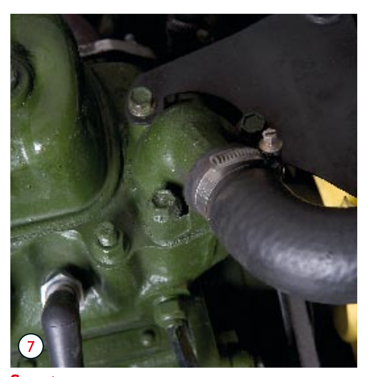
Symptom: Engine not getting warm, or getting too hot Diagnosis: Thermostat stuck open

The handbrake is one of the least efficient items on a Mini, but it's important to be able to park your Mini on a hill and come back to find it where you left it! There are two areas that need looking at: the brake unit and the cable. The former is adjusted by turning the adjusting screw in clockwise — as viewed from looking at the back plate — until the drum locks up, then backing off two notches (or until the drum moves freely again). The brake cable is operated by a bracket on the centre of the rear subframe, which should be well greased, and two moving quadrants, one on each of the radius arms. These need to moving freely to allow the cable to be pulled backwards and forwards, which isn't helped by all the muck from the road. Free up and grease these if they're seized. Finally, adjust the cable from the inside of the car on the back of the handbrake lever to give four or give clicks before the brakes hold.