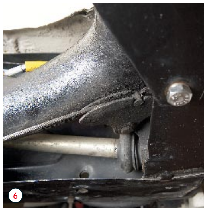
Symptom: Handbrake not holding Diagnosis: Seized handbrake cable

The handbrake is one of the least efficient items on a Mini, but it's important to be able to park your Mini on a hill and come back to find it where you left it! There are two areas that need looking at: the brake unit and the cable. The former is adjusted by turning the adjusting screw in clockwise — as viewed from looking at the back plate — until the drum locks up, then backing off two notches (or until the drum moves freely again). The brake cable is operated by a bracket on the centre of the rear subframe, which should be well greased, and two moving quadrants, one on each of the radius arms. These need to moving freely to allow the cable to be pulled backwards and forwards, which isn't helped by all the muck from the road. Free up and grease these if they're seized. Finally, adjust the cable from the inside of the car on the back of the handbrake lever to give four or give clicks before the brakes hold.